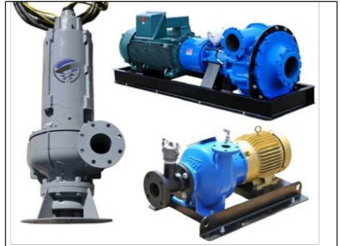
*Typical Deployment Photo. Dredge pumps can be deployed vertically or horizontally. Photos for general guidance. Contact us for further details.