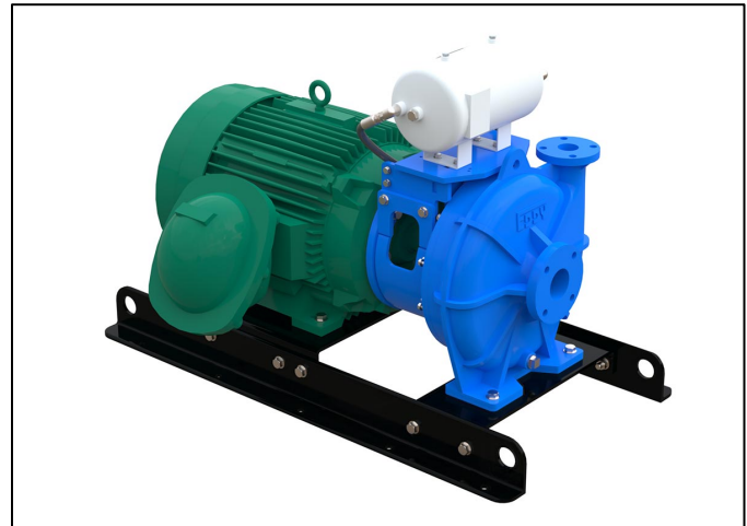
*Typical Deployment Photo. Dredge pumps can be deployed vertically or horizontally. Photos for general guidance. Contact us for further details.